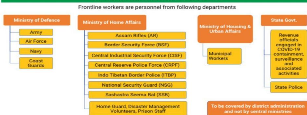
FIGURE 7.3: FRONTLINE WORKERS CATEGORIES

Municipal Workers: are defined as "all workers* who are engaged in providing any form of public health, sanitation and waste management services for the city or town"